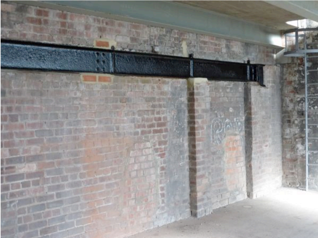
Embedded Beam between Pump House and Winding House