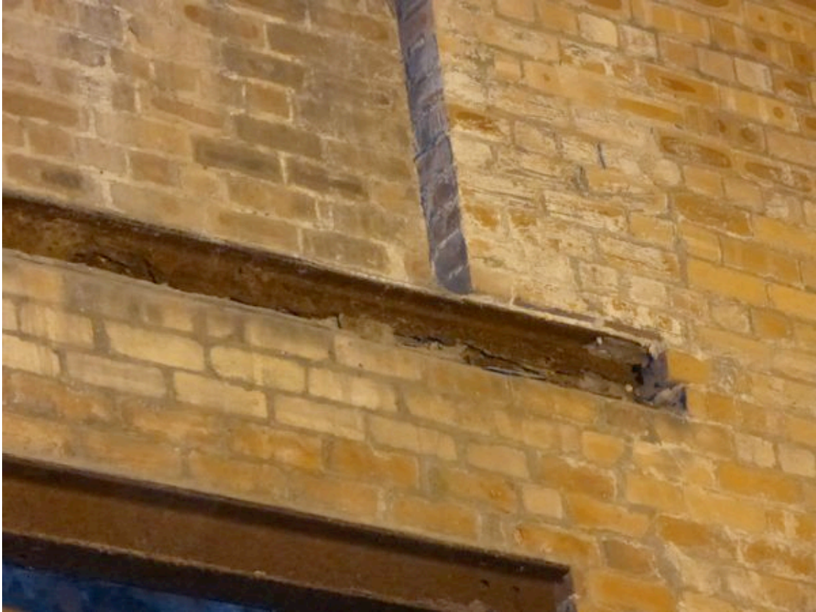
Corrosion in Beams over Entrance