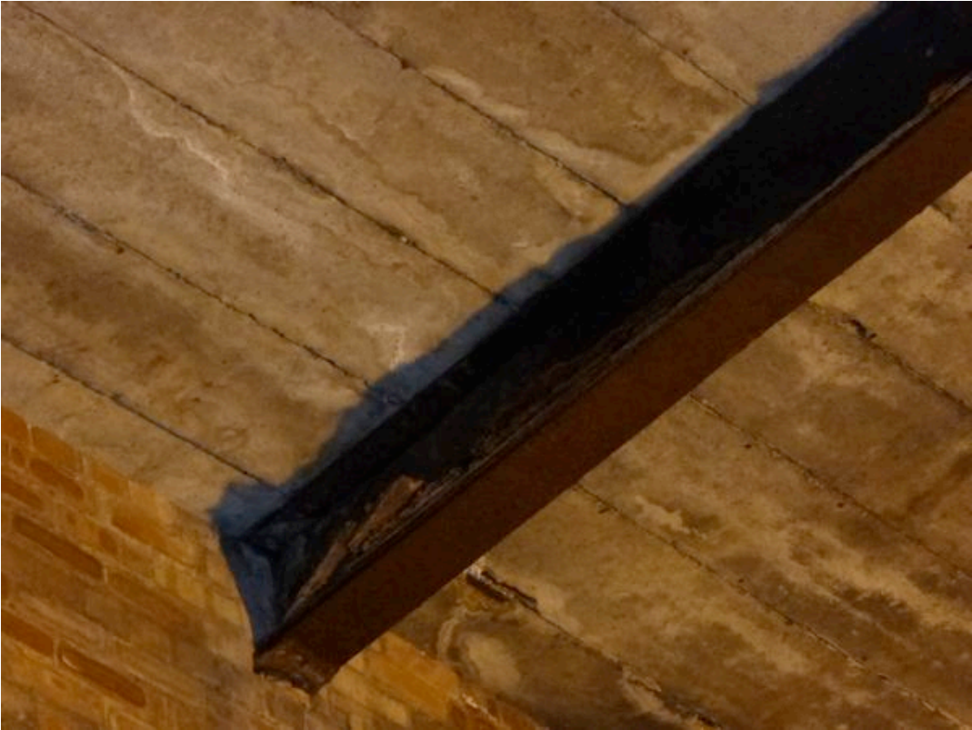
Corroding Roof Support Beam