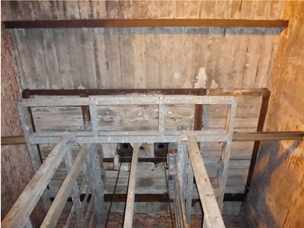
Steel Framework under Winding Gear