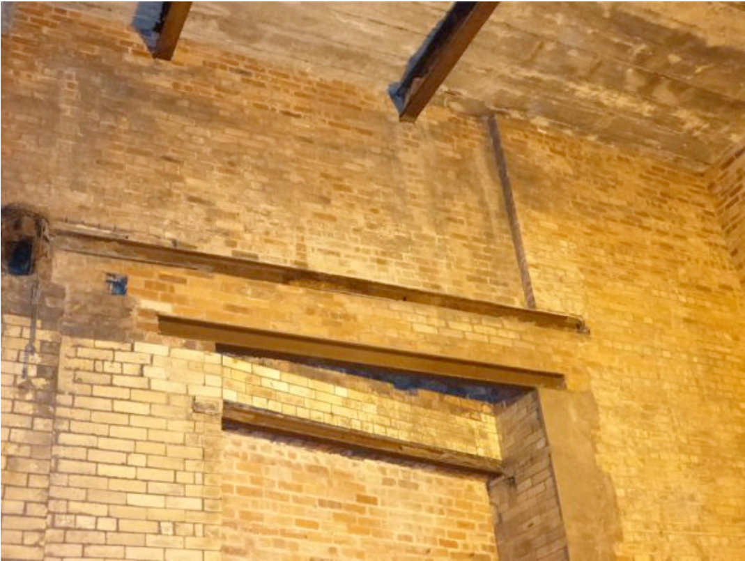
Beams over Entrance Passageway