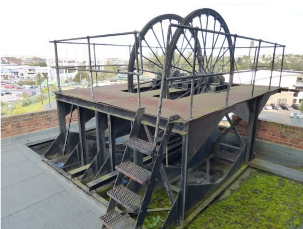
Winding Gear on top of Winding House