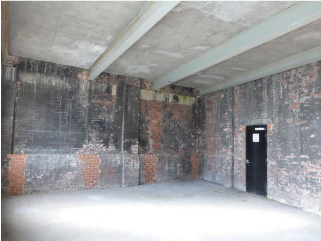
Top Floor of Pump House