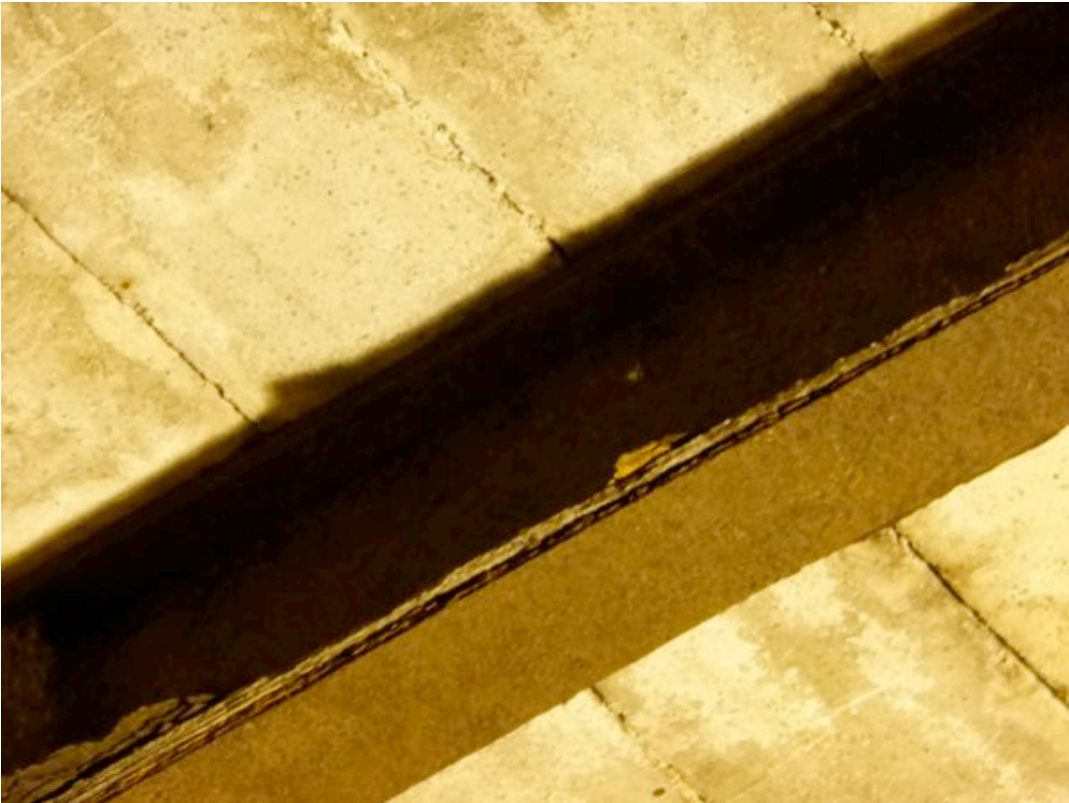
Corroding Roof Support Beam